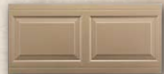
680 Raised Panel