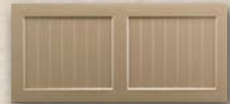
660 Carriage House