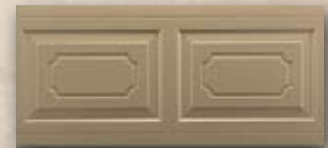
690 Sculptured Raised Panel

Optional decorative hardware is available on all models