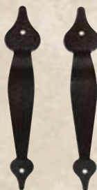
Handles (standard on 660)